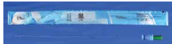
The Cure Ultra for men is a 16", pre-lubricated catheter with polished eyelets on a straight or coude tip, a unique, 'No Roll' funnel end, and proprietary CoverAll™ lubricant application process. Not made with DEHP, BPA, or natural rubber latex.

2. Inspect catheter before use. If the catheter or package are damaged do not use.