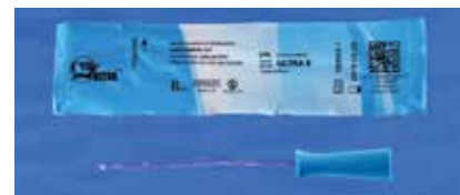
The Cure Ultra features a pre-lubricated straight tip with polished eyelets and 'No-Roll' connector/funnel end.

The sterile, single use Cure Ultra is a ready to use catheter for women. The small package features an easy tear top and enables disposal of minimal material. The catheter features polished eyelets on a pre-lubricated straight tip and a unique, 'No Roll' connector/funnel end. It is ideal when discretion and convenience are important considerations.